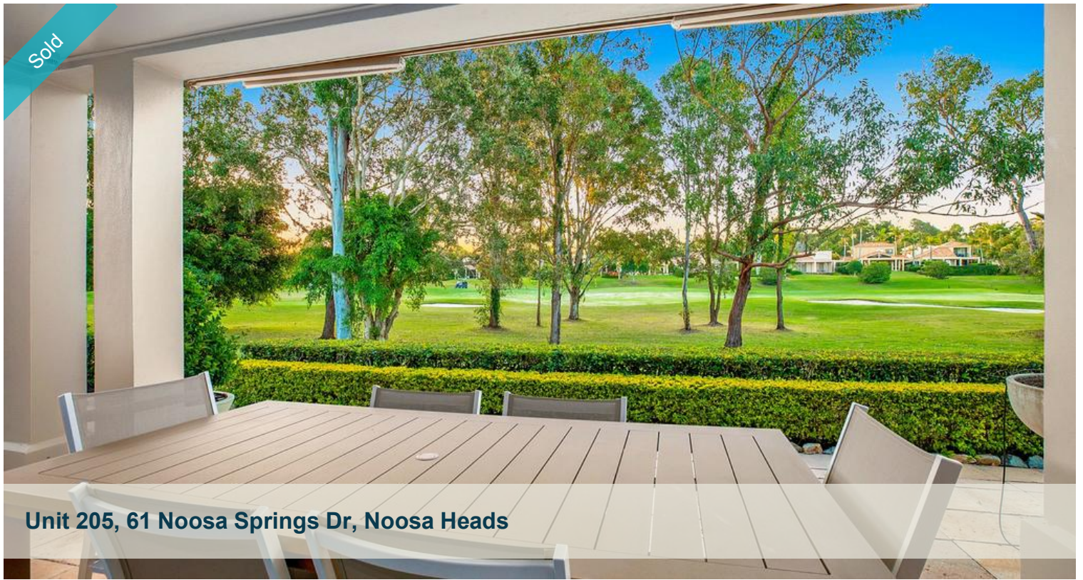
Unit 205, 61 Noosa Springs Dr, Noosa Heads